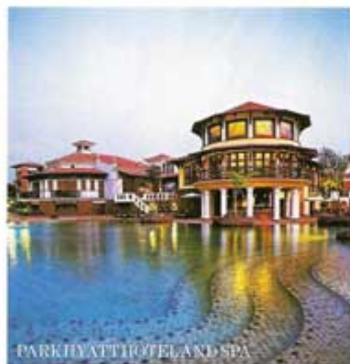
PARK HYATT HOTEL AND SPA