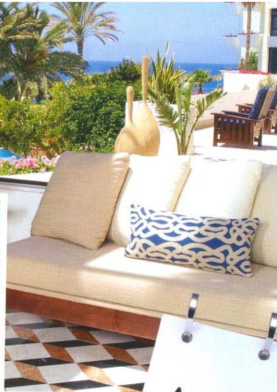
Balmy days in the sun at the Azia Resort