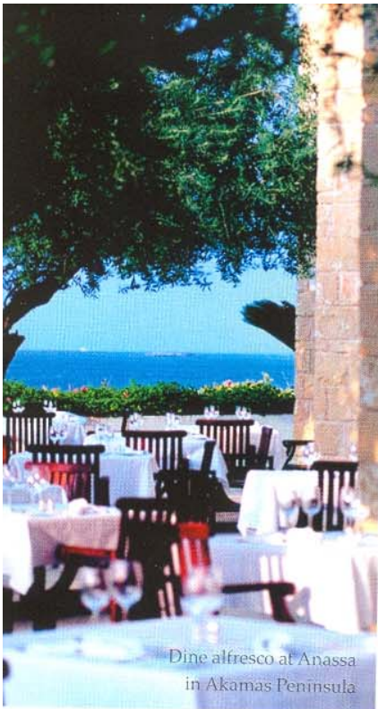
Dine alfresco at Anassa in Akamas Peninsula